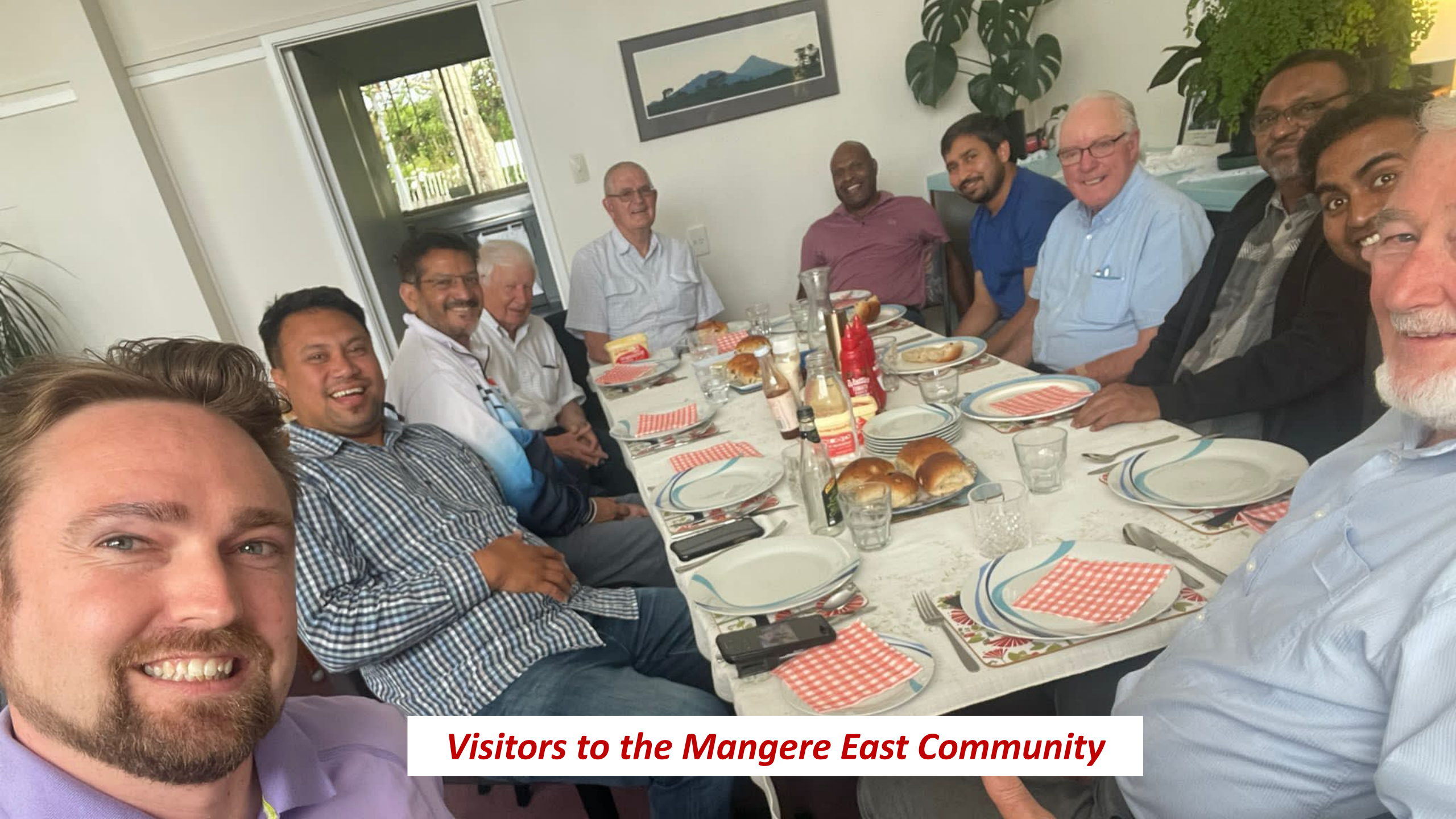
Visitors to the Mangere East Community