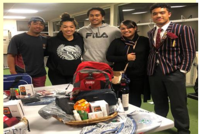
3 rd Prize Winners